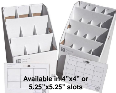
Available in 4"x4" or 5.25"x5.25" slots

Attractive corrugated cardboard with deep gray lettering on white background. Durable construction with reinforced bottom. Handholes allow easy relocation in office. Identification labels on interior & exterior. Removable "Document Locator" card for easy labeling is stored concealed in the SlantFile.